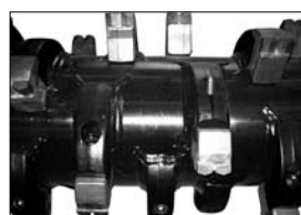
Rotor type STCH

The data refers to the machine without options.