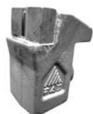
Tooth type STCH