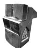
Tooth type STCH/SD