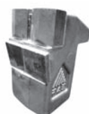
Tooth type STC/SD