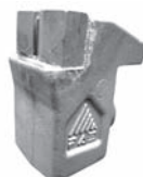
Tooth type STC