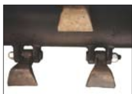
Rotor with PMM hammers

The data refers to the machine without options.