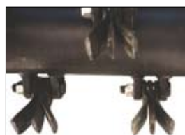
Rotor with “Y” flails