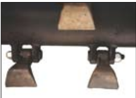
Rotor with PMM/SSL hammers

The data refers to the machine without options.