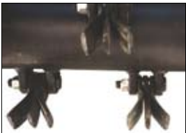
Rotor with "Y" flails