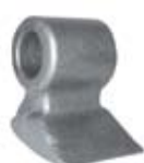
Hammer type FMM