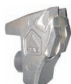
Tooth type C/SD