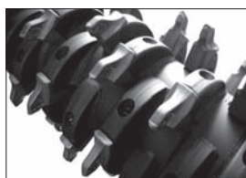
Rotor Type 300U "B"

The weight refers to the machine without options. Technical datas for models with mechanical transmission upon request.