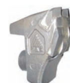
Tooth type C/SD