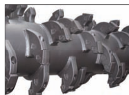
Rotor Type 300U "C"