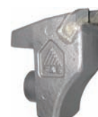
Tooth type C